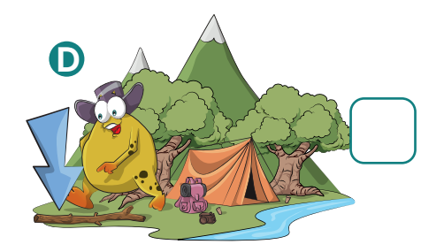
Freddy looks for a stick.