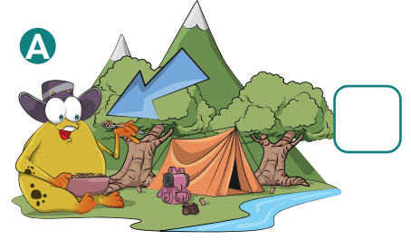
Freddy Frog has breakfast at the foot of the mountain.