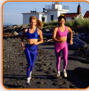
go jogging / 3:45