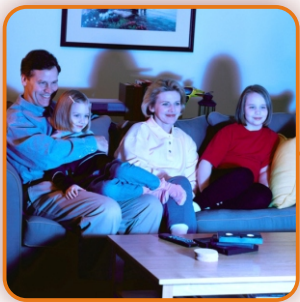
watch TV / 8:30