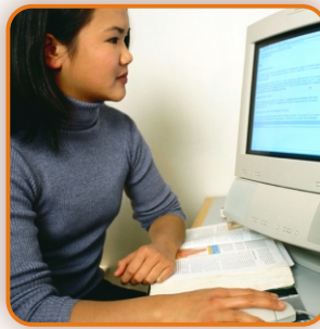
do my homework / 6:00