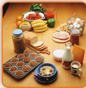
have breakfast / 7:00

2 Now write what you do on Tuesdays. You can use the activities in the box or write your own.