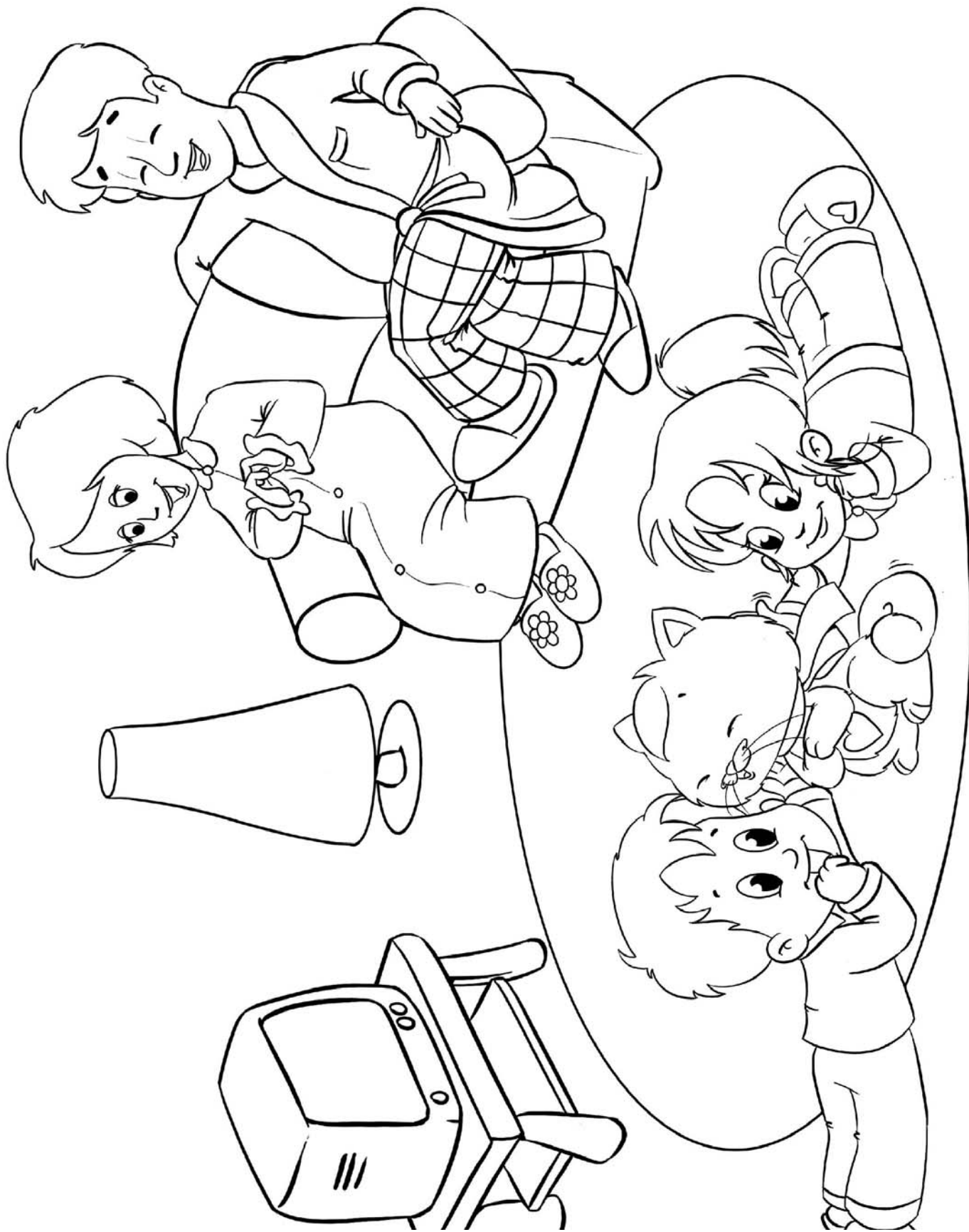
Unit 1: Colour the picture.